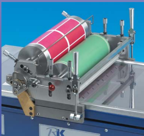
Below: Detail of K303 Multicoater Flexo head

This instrument enables accurate and reproducible prints and coatings to be made using a wide range of products, and many different substrates. The different heads detailed below are fully and easily interchangeable, providing Gravure, Flexo and exceptionally accurate surface coatings and laminations. The smallest differences in products can be detected by applying multiple samples adjacent to each other.