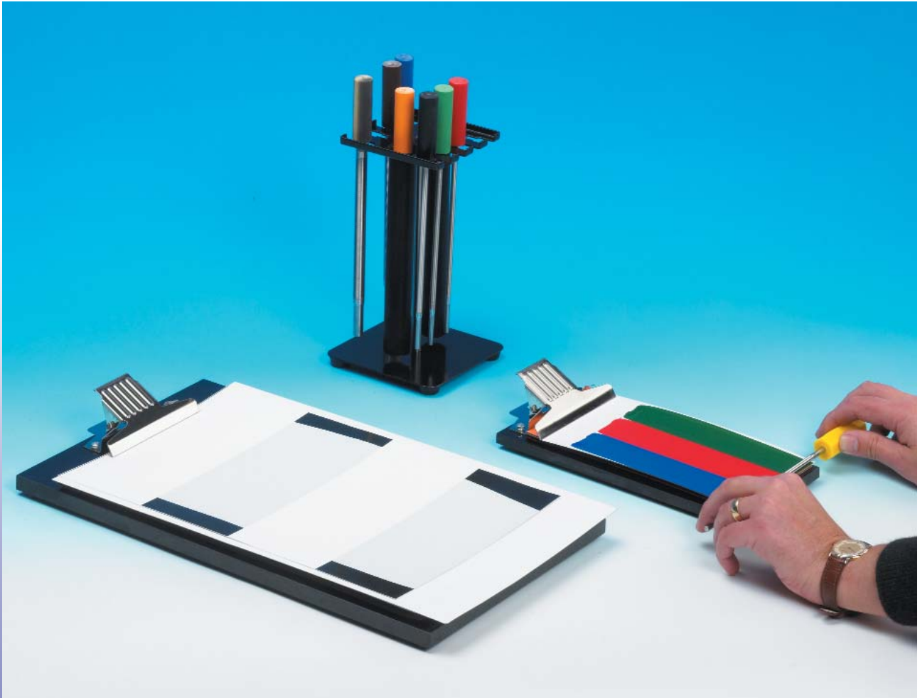
Small K Hand Coater with cleaning/storage rack. Three liquid inks being applied simultaneously. Also shown, Large K Hand Coater with a contrast test card.

The K Hand Coater provides a simple but effective means of applying paints, printing inks, lacquers, adhesives and other surface coatings onto many substrates including paper, board, plastic films, foils, metal plates, glass plates, wood etc. Two or more coatings can be applied side-by-side in a single operation making the system ideal for comparing products.